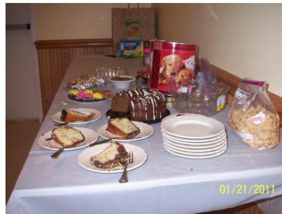
Kids were here!!!