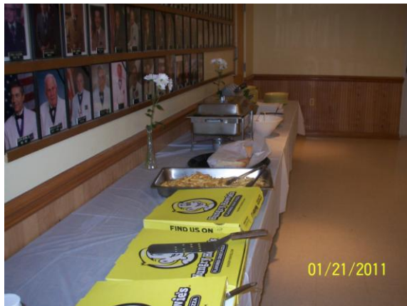
Dinner is served.