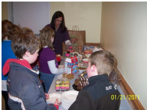
The ice cream comes out, the basketball players come in!